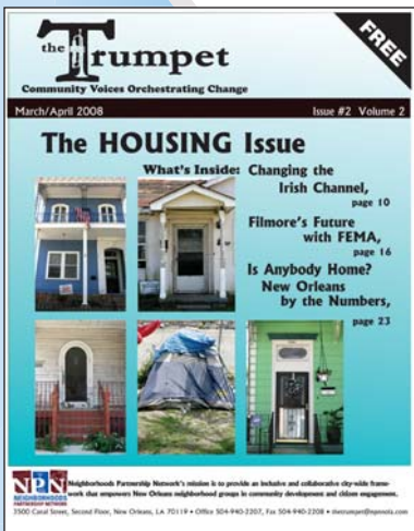
The Trumpet Magazine