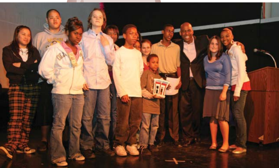
2008 Trumpet Award Winners The ReThinkers