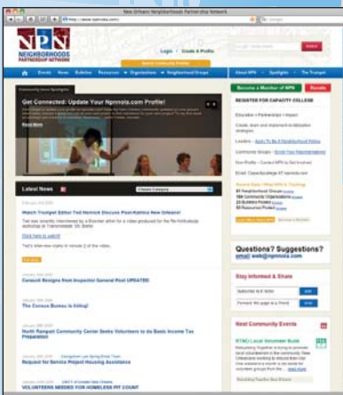
Our website, www.npnola.com

REFLECTING ON THE YEAR BEHIND US is almost as exciting as envisioning those ahead. And 2008 deserves considerable reflection as a year in which NPN continued to grow and advance in building a network reflective of the “whole” neighborhood in the city of New Orleans. Our idea of a holistic neighborhood approach has allowed NPN to expand its network and re-evaluate who and what makes a neighborhood. Our conclusion: it takes EVERYONE, neighborhood associations or groups, nonprofits, businesses, individuals and government.